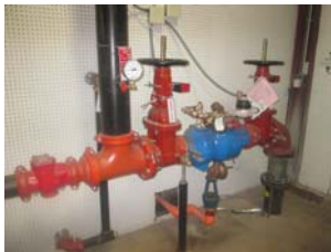
The main building Fire Protection Riser Assembly.

Over the past year we have greatly improved our building's safety and security. By adding a fully equipped NFPA13 fire protection system and fire alarm system, you can rest assured that equipment being repaired and stored at our facility is being monitored 24/7. Our new security system includes video surveillance, motion detectors and automatic law enforcement dispatch.